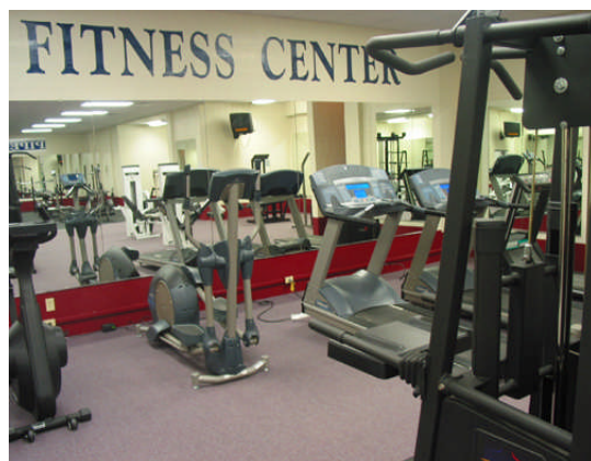
After hours fitness center