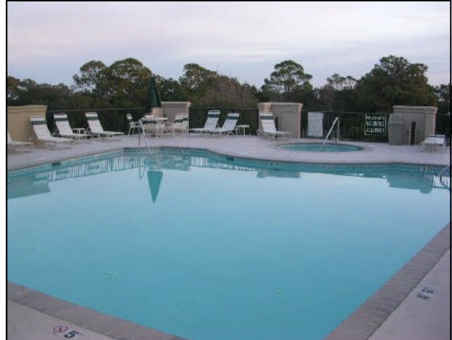
After hours pool environments

* Initial capital investment varies based on the requirements of the specifically designed scope for each property.